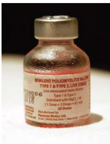
Bivalent OPV: an important new tool for the Global Polio Eradication Initiative.

depending on the outcome of this trial, that major strategic shifts in the use of these products should be anticipated (as is the case with bOPV). These clinical trials will help inform the finalization of the new Global Polio Eradication Initiative five-year Strategic Plan (expected for publication in January 2010).