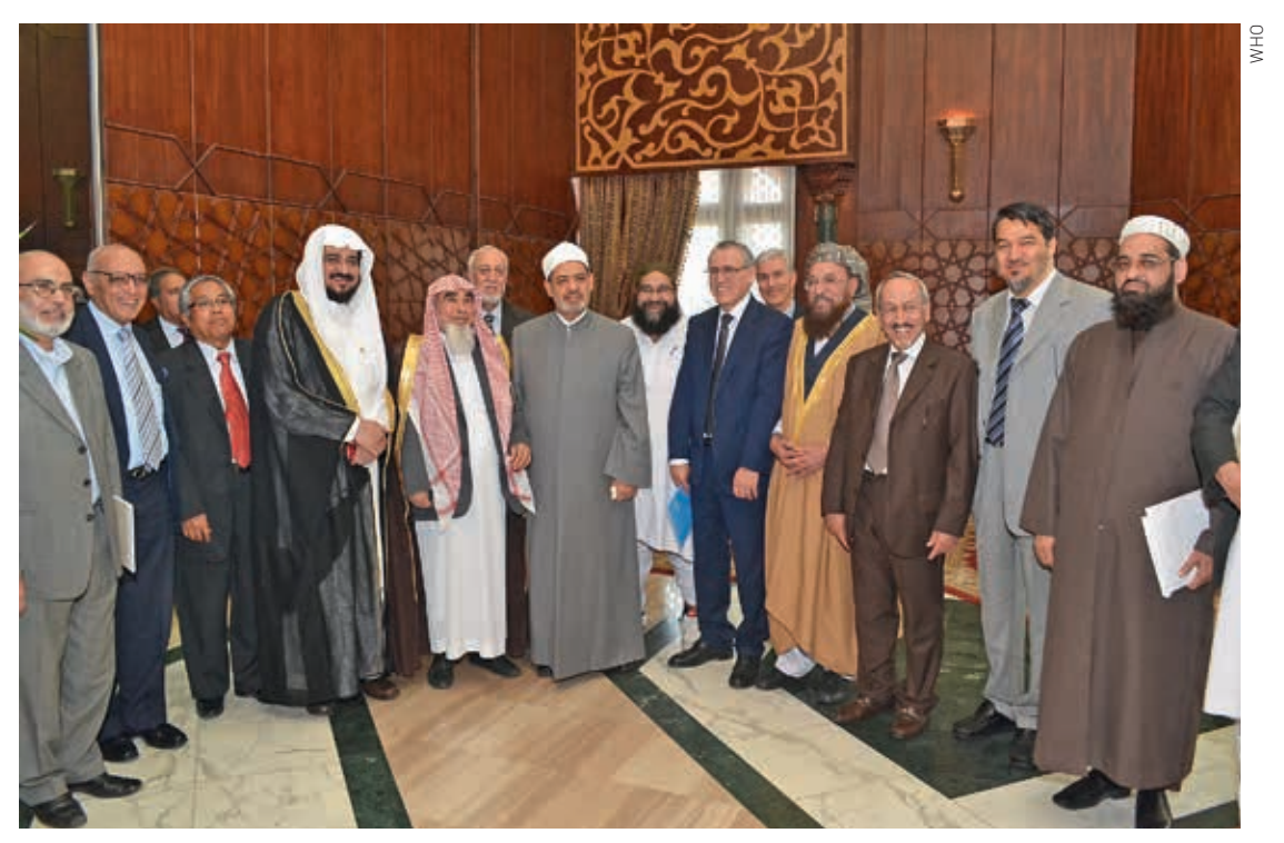
Grand Imam of Al-Azhar receiving Muslim Scholars to discuss children rights to be protected by vaccination.